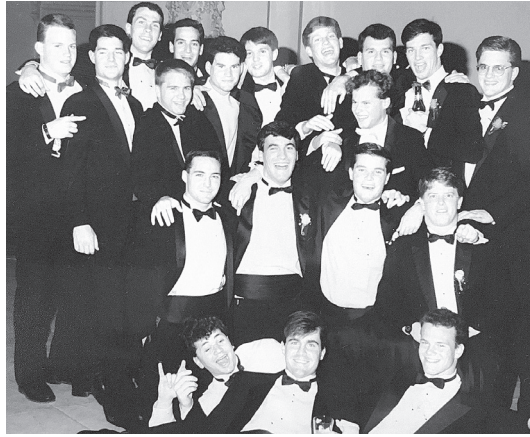
The class of 1991 poses at the Sigma Chi formal at Memorial Hall in Philadelphia, which is now home to the Please Touch Museum.

Out of the 18 members of the pledge class, 15 are going back for the reunion. They plan