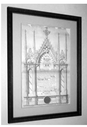
1875 Charter Reframed and Hanging in Chapter Room

This past summer, the House Corporation had this historic document, along with the 1912 Charter that founded the House Corp., both taken down and restored. Laser-scanned copies of each were reframed and returned to display at the chapter house. The original documents have been secured safely in archival storage. The Board is considering opportunities to make copies of these documents available to alumni.