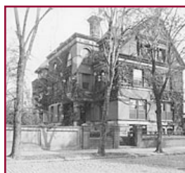
Sigma Chi at 3809 Locust St, c. 1927

Sigma Chi went above and beyond in the spring 2007 semester when recruiting a new pledge class. The Chapter successfully recruited a 21 member pledge class, which is the largest pledge class in recent Sigma Chi history.